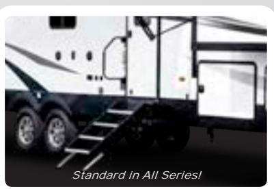
Standard in All Series!