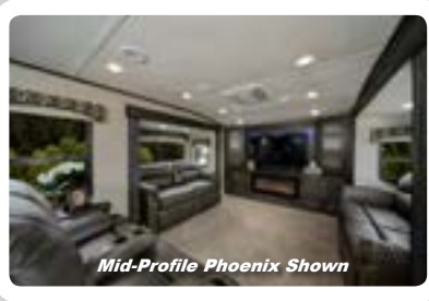
Mid-Profile Phoenix Shown